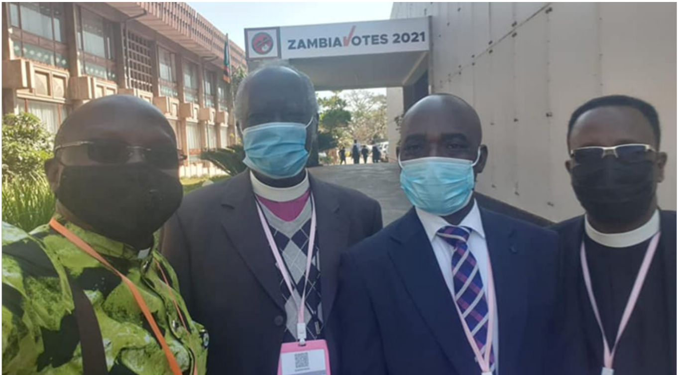
AACC international observers preparing themselves to move out to observe Zambia elections

from 6:00 am to 6:00 p.m. on 12th August 2021 as planned by ECZ.