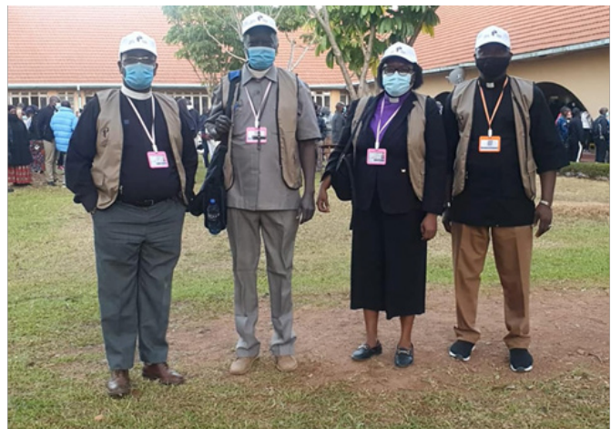
AACC international observers at the field during election day, August 12, 2021

The AACC International Observers at the Electoral Commission of Zambia to be updated on the preparedness, August 10, 2021