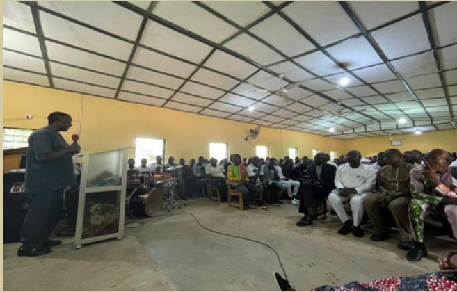
AACC General Secretary speaking to the Bronnum Lutheran Seminarians