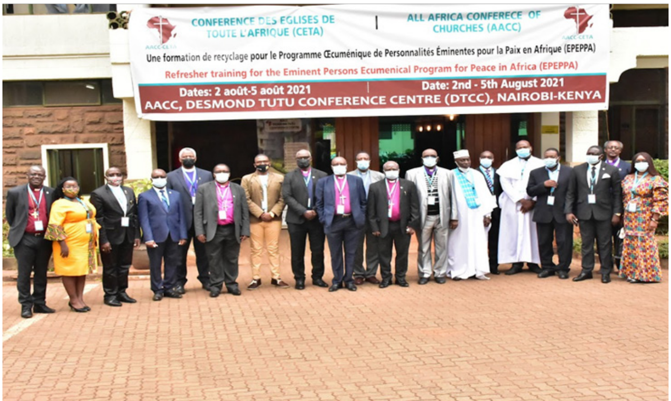
Group photo of the Eminent persons during refresher training at DTCC in Nairobi, August 4, 2021

Church leaders cannot afford to give up on peace in Africa, work that is complex and requires personal sacrifice.