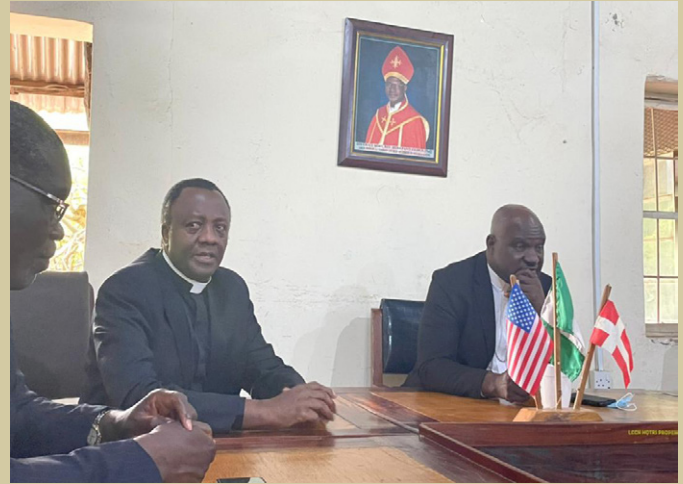
AACC GS meets with LCCN Board of Trustee

The AACC team held a bilateral meeting with the Board of Trustee of the LCCN and members of the governance structures. The meeting comprised of bishops from the different dioceses of Adamawa state, and eminent persons from the government institutions who are part of the board.