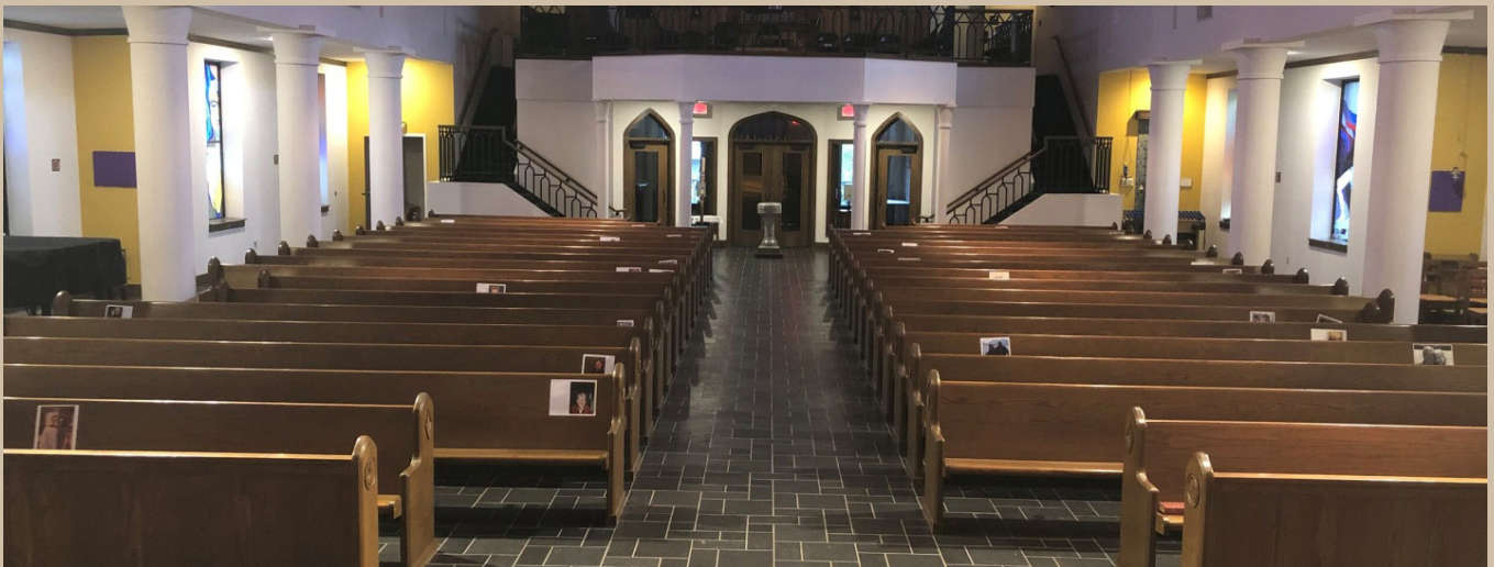
Churches stayed empty during COVID-19 lockdowns

Below are perspectives from some of the main speakers, in their own words.