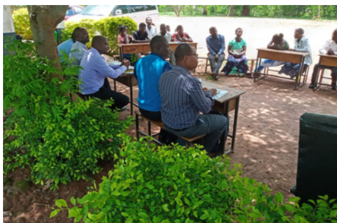
Training church leaders on GBV related issues in Thyolo, Malawi