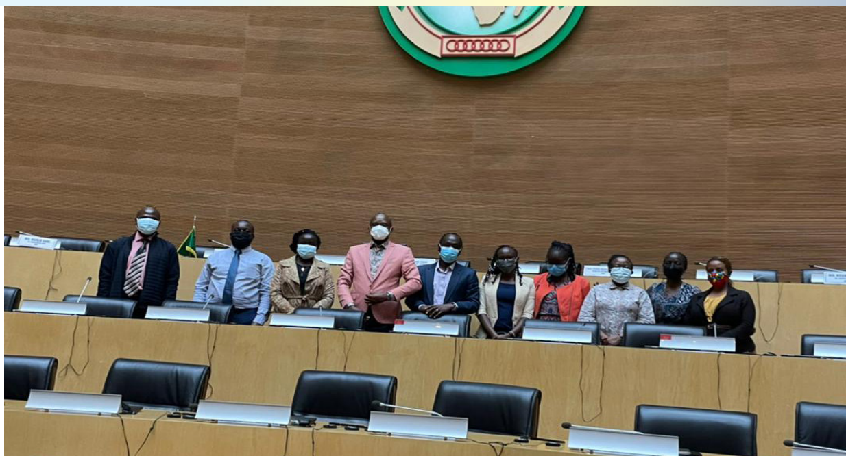
RPP representatives pose for a group photo at the AU Headquarters in Addis Ababa, Ethiopia

Peace and Security in the Horn formed the main agenda when the Eastern Africa Regional Peace Programme (RPP) partners paid a courtesy visit to the African Union Commission (AUC) institutions on August 18-19, 2021.