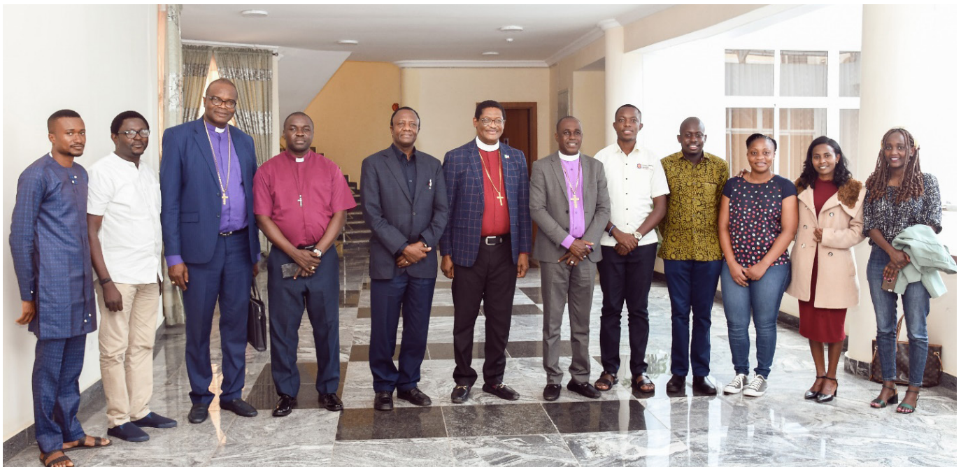
The Primate of the Church of Nigeria, AACC GS, Bishops in the Church of Nigeria, AACC Staff and youth participants