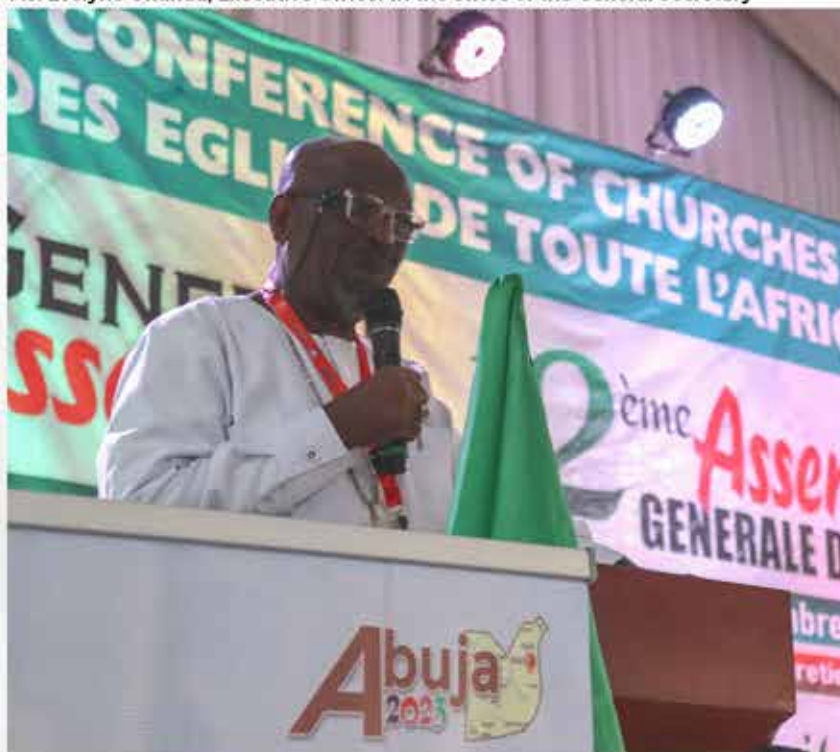
AACC President Welcomes Assembly delegates, and other participants