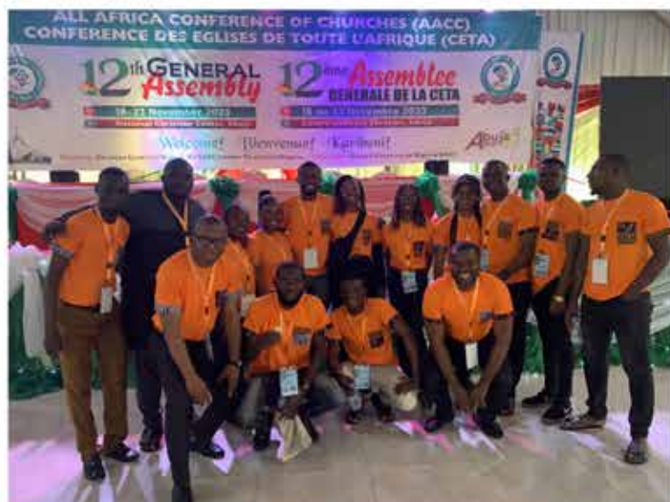
Some of the stewards posing for a photo after preparing the plenary hall