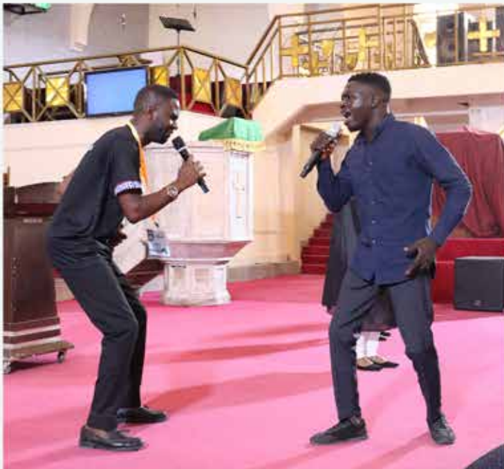
Music performances during the opening devotion