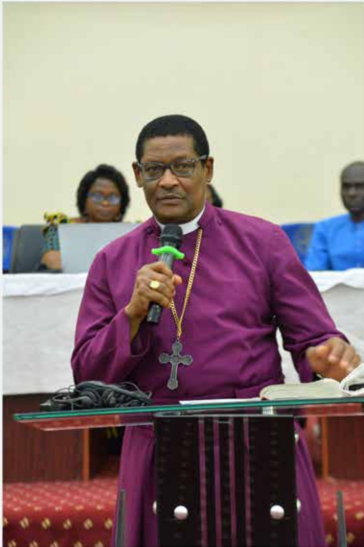
The Most Rev'd Henry Chukwudum Ndukuba, Archbishop, Metropolitan & Primate of the Church of Nigeria welcoming the Pre-assembly participants