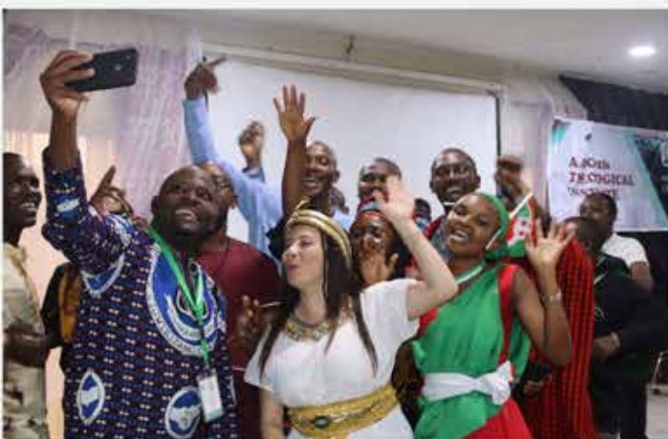
A light moment as 9 th Theological Institute students pose for photos during the culture night.