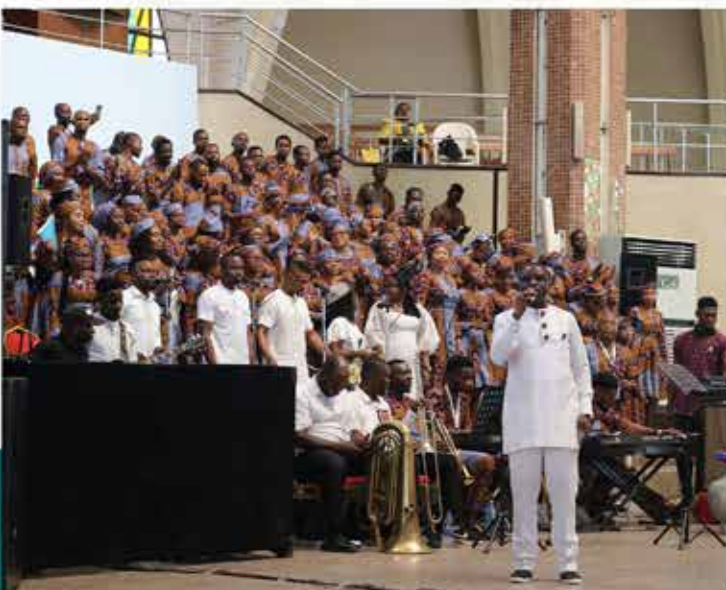
Performance by the mass choir