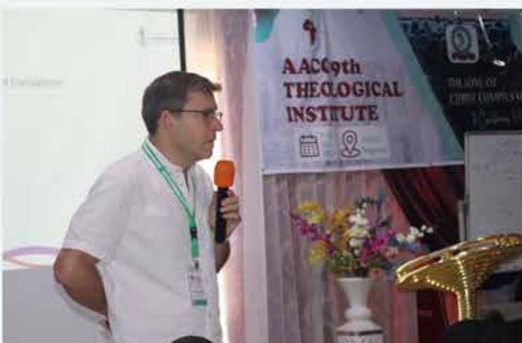
Prof. Benjamin Simon from the World Council of Churches Bossy Ecumenical Institute delivering a lecture.