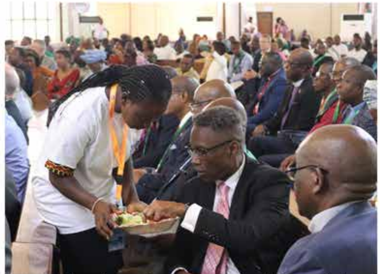
A steward serving cola nuts to the participants during the celebrations