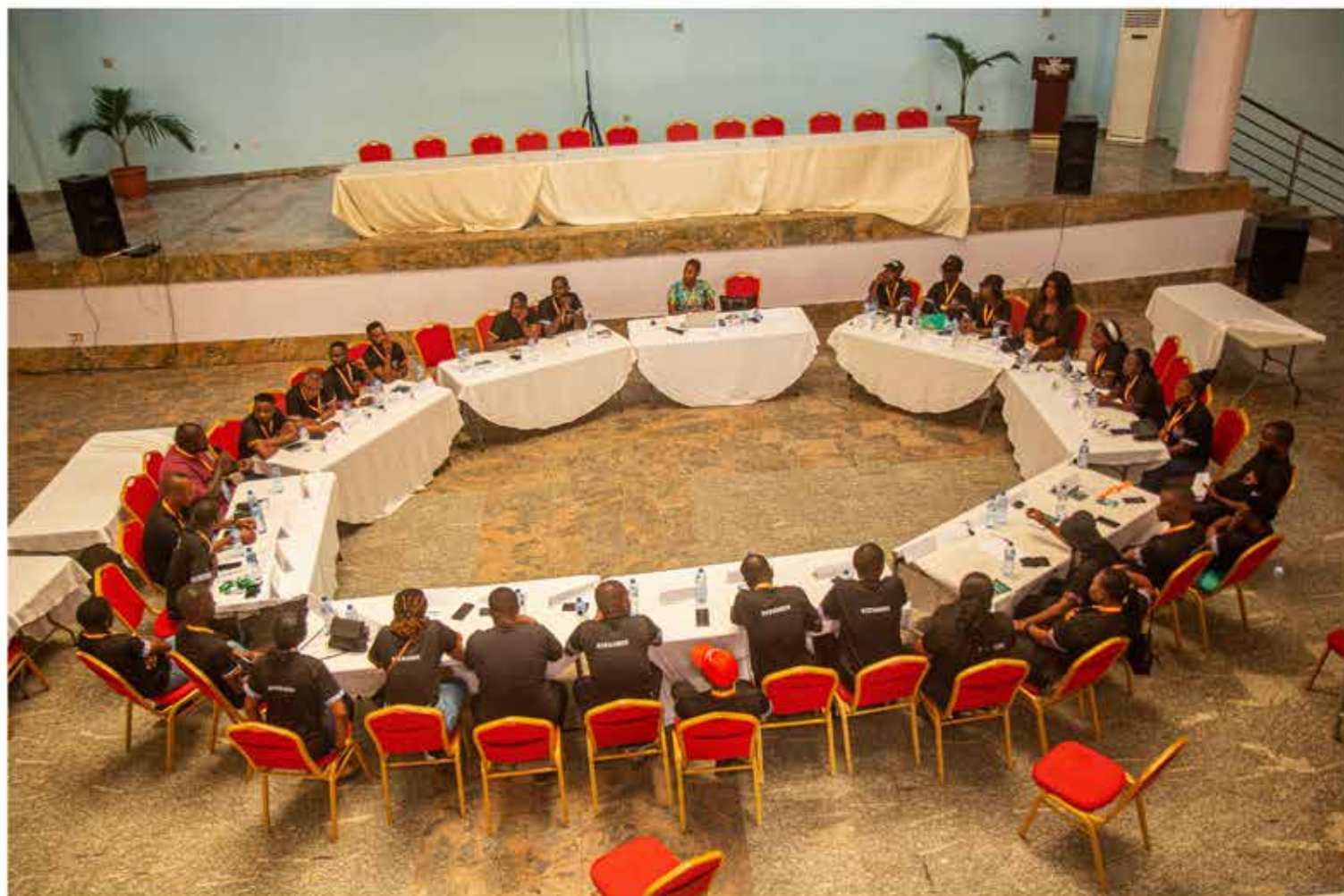
Stewards having a round table conversation to share roles and responsibilities