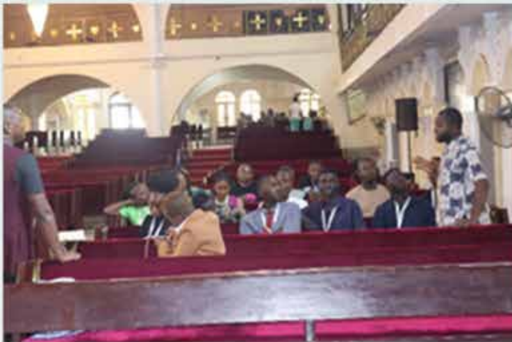
Group discussions at the Pre-assembly