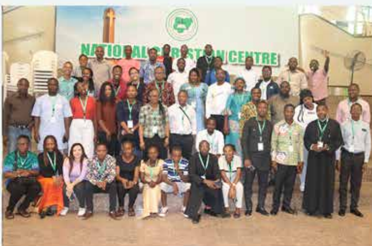
9 th Theological Institute students at the 12 th GA venue.