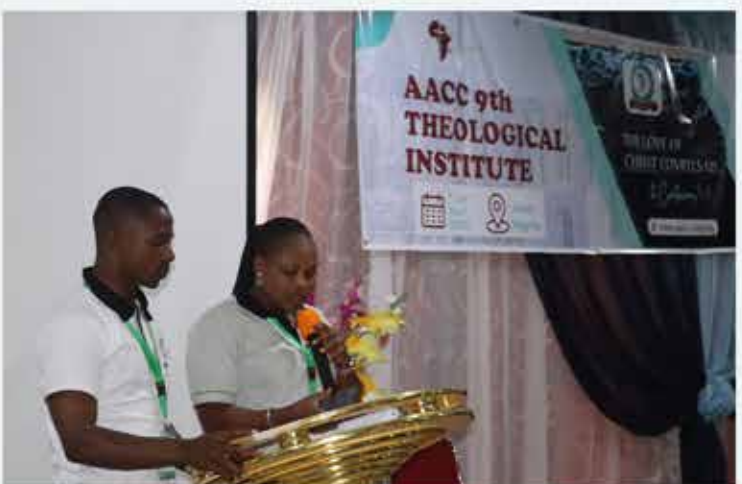
Group presentation at the 9 th Theological Institute