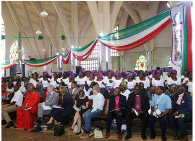
Women leaders presenting a thanksgiving song