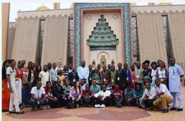
Participants at the Abuja National Mosque