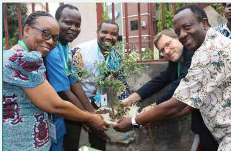
9 th Theological Institute Lecturers and facilitators planting a tree at the First Baptist Church-Garki-Abuja