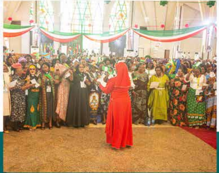
A performance of the womens choir