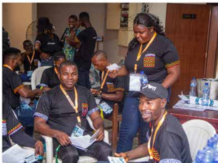
Some of the stewards on duty