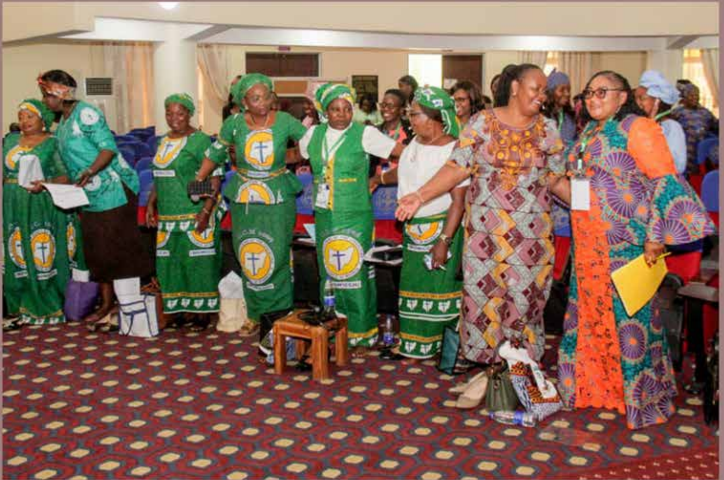
Nigerian women leaders presenting a song during the launch of the 16 days of activism.

AACC's historic launch of the 2023 16 Days of Activism against Gender-Based Violence (GBV) took place on 18 th November 2023 during the closing ceremony of the Women Pre-assembly. More than 200 participants, including Youth and Male Champions for Gender Justice were part of the launch. Preceding the 12 th General Assembly, this event aimed to synchronize with the Assembly, emphasizing the roles of women, youth, and church leaders in combating violence against women and girls.