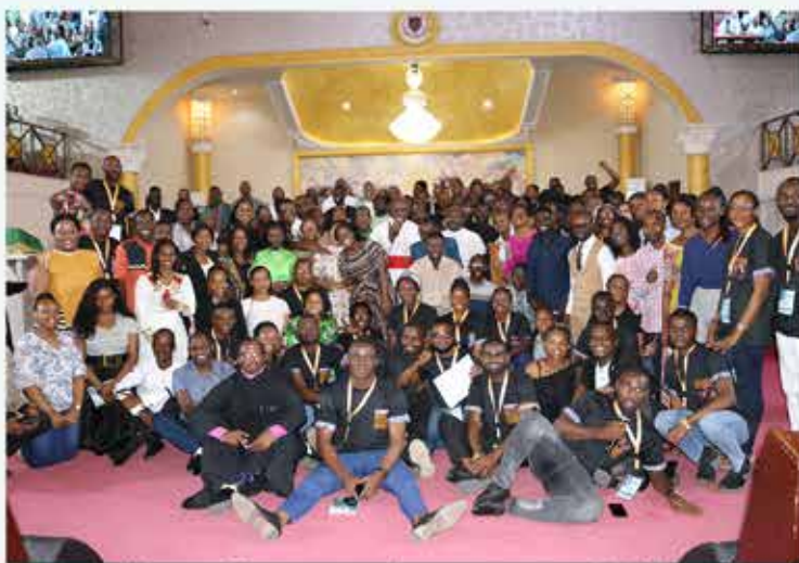
Pre-assembly participants capturing a moment with Bishop Micheal