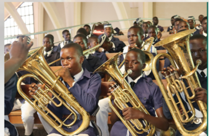
Band performance during the anniversary

"In this celebration, we draw the inspiration to keep us focused and determined to build the Africa we want: An integrated, prosperous and peaceful Africa, driven by its own citizens, representing a dynamic force in the international arena by 2063."