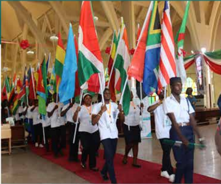
Flag procession led by the stewards