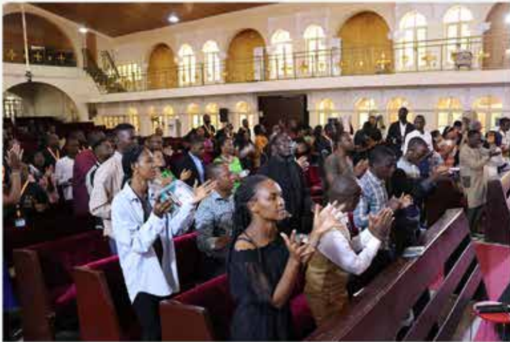
Praise and worship session during the opening devotion