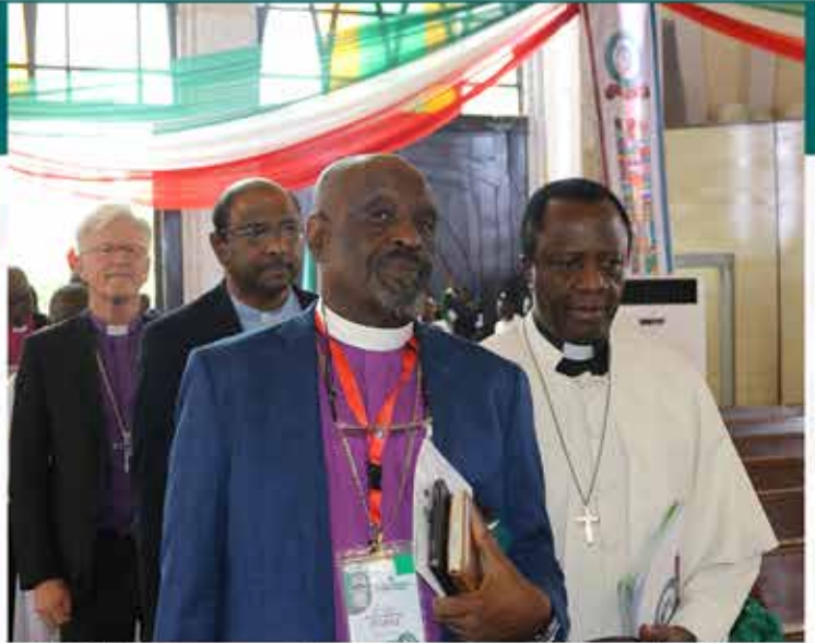
AACC President and General Secretary followed by WCC President and General Secretary in the procession