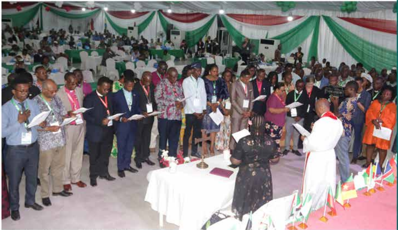
Induction of the new AACC leadership