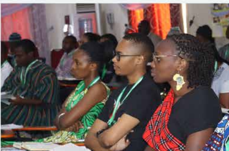
Some of the students during a lecture