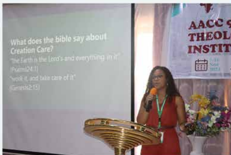
One of the students from Mauritius responding to a lecture