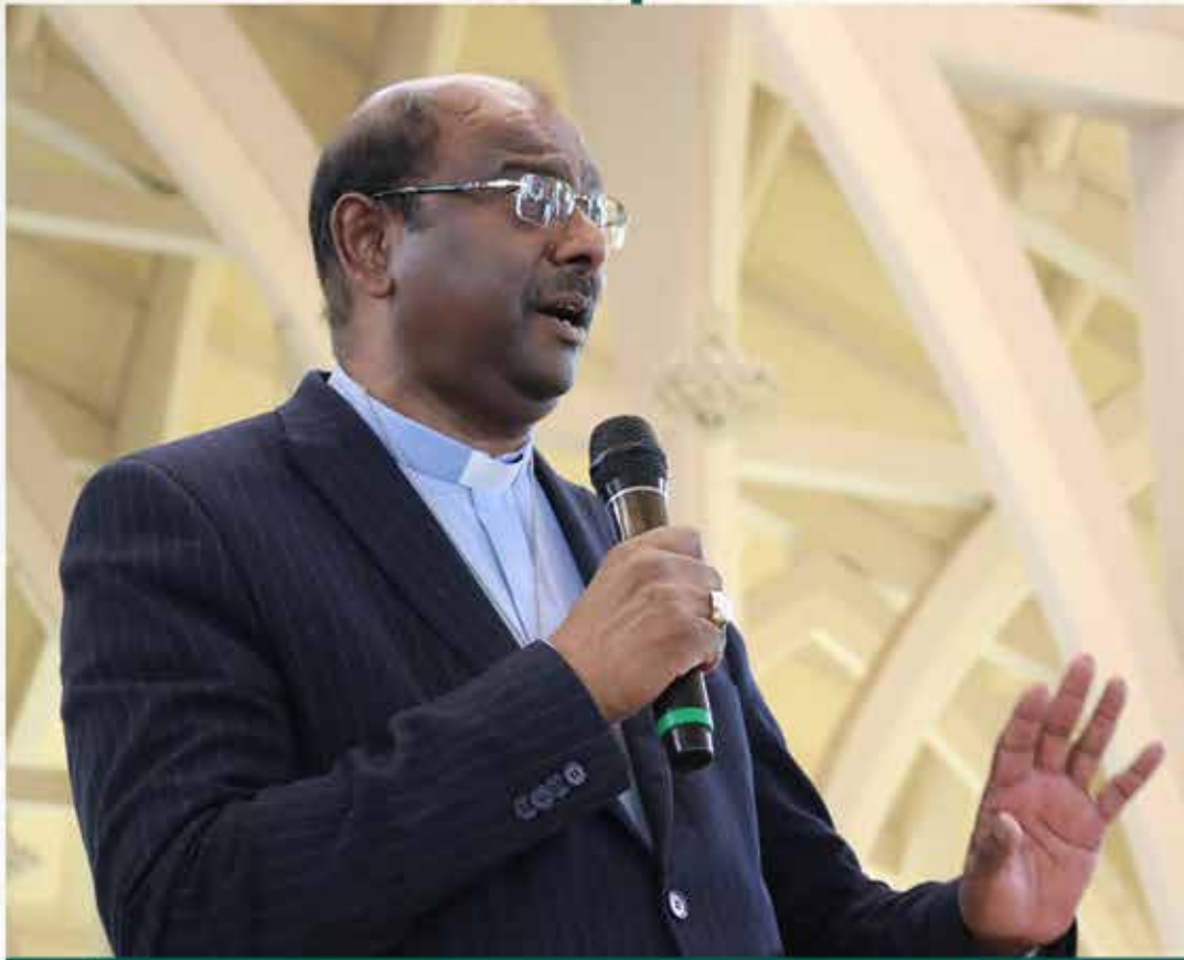
WCC General Secretary making the keynote address