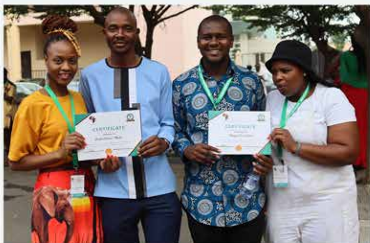
Students showing off their certificates.