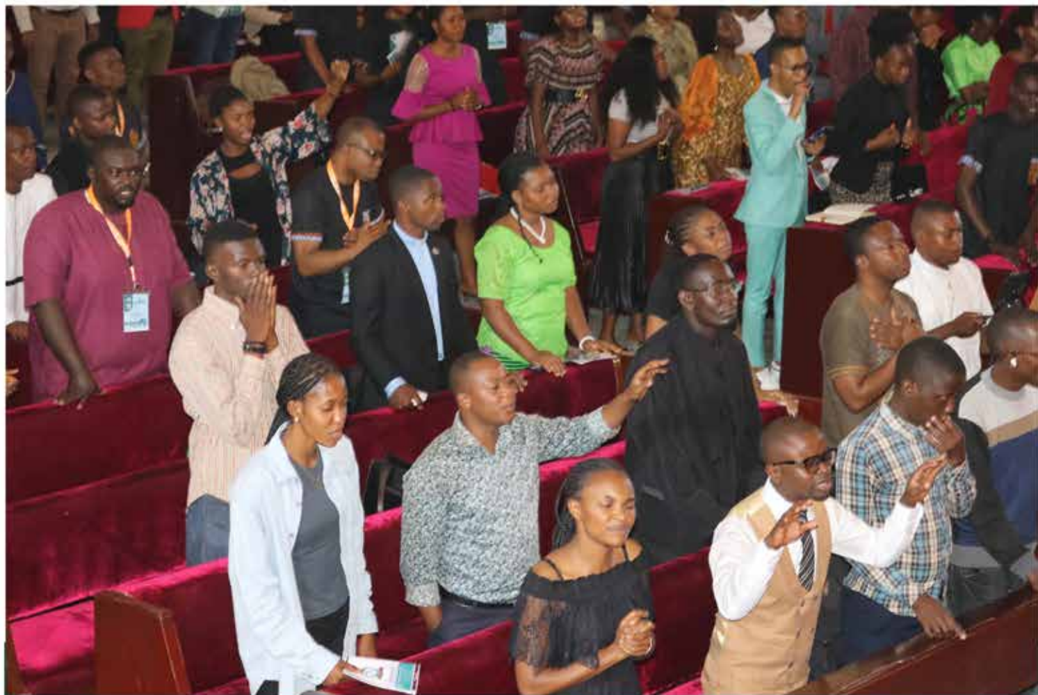
Some of the youth Pre-assembly participant during devotion

The Pre-assembly was a time of building Christian fellowship and witnessing together among the participants. Each day began with an hour of devotion during which participants worshipped God together through music, Biblical reflection, and intercession prayers. In addition to the morning devotion, mid-day prayers were held every day between 12:00 and 12:30. These thirty minutes were fully dedicated to worshipping God through meditative music and intercession prayers. At the end of the day, the participants always sang one Christian hymn and then said a closing prayer led by any of the delegates who would volunteer to do so.