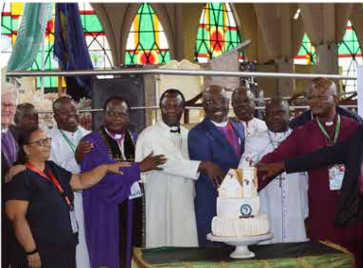
Cake cutting in celebration of AACC's legacy