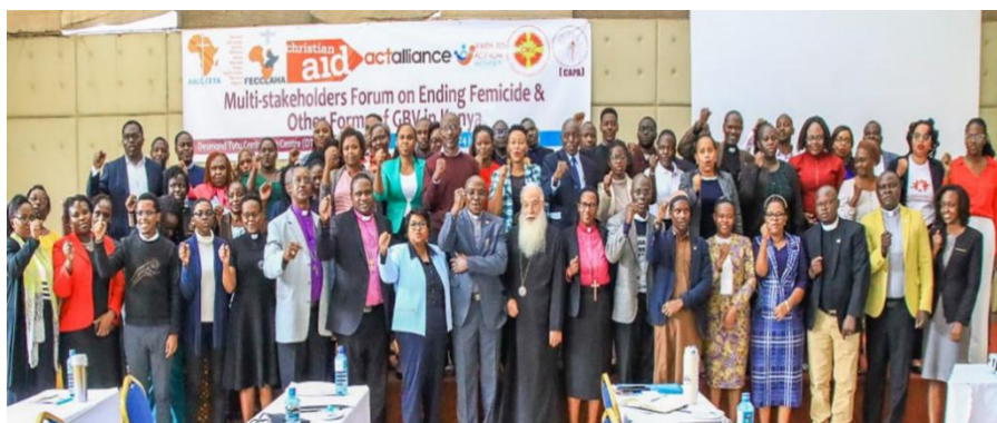
Group photo of the Multi-stakeholders Consultation on Ending femicide and other forms of GBV in Kenya

The AACC in collaboration with the FECCLAHA, Christian Aid, ACT Alliance, F2A Network and CAPA with support from Church Women United, convened a Forum on ending Femicide and other forms of GBV. The consultation forged an Interfaith and Ecumenical obligation for sustained efforts towards ending femicide and other forms of GBV.