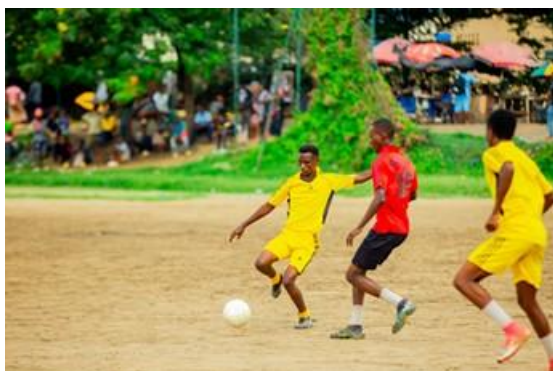
Burundi interfaith youth Forum members pose for a group photo as they out for the community dialogue

cohesion and advance the implementation of the UNSCR 2250 resolution on Youth Peace and Security. With such support, the interfaith youth forum in Burundi conducted a community dialogue on peaceful co-existence and promoting social justice in December 2024. The dialogue was accompanied by team building games and fun activities such as football, netball and cultural dance exhibitions with a focus on ‘ accelerating social cohesion. ’ 30 youth participated in the dialogue and 300 in the games and fun activities. The young people were encouraged to utilize their talents in music, sports and media to be peace makers and popularize the UNSCR 2250 Resolution on Youth, Peace and Security and to strengthen social bonds that strengthen social cohesion in their country.