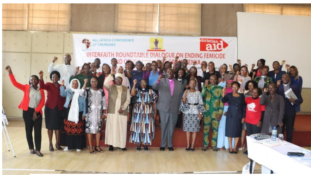
Group photo of participants at the Interfaith Roundtable Dialogue on Ending Femicide