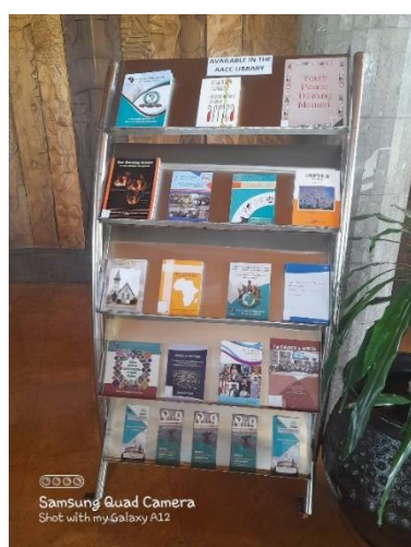
Library Books Displayer at the Reception

An archivist/ Programme Assistant was recruited from 6 th May and the major task was to Develop, organize, maintenance and day-to-day running of the Archives and the library. So far Nine (9) boxes of archive materials have been Digitized Identification, Classification and Indexing with the use of Keywords. Recording into Excel Document for easy access. Transfer of relevant books from Stores, dusting and arranging. Classification using Dewey Decimal Classification. Display of the Artifacts donated to AACC from different parts of Africa. Display of Framed Pictures on the library wall, as well as Books Displayer table.