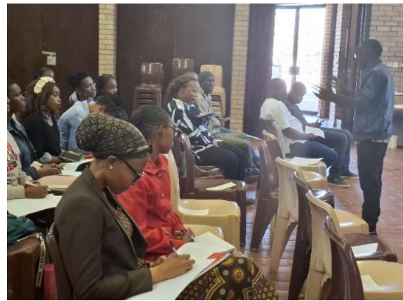
AACC Executive Youth Secretary Facilitating a session