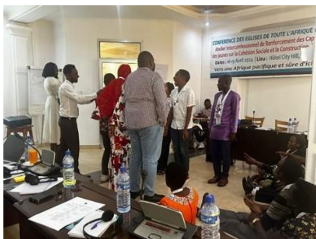
Workshop Participants during a session

Established in 2021, the interfaith youth Forum in Burundi has been advocating for peace and unity in urban and rural communities in Burundi. To strengthen the forum's capacity to promote social cohesion and to align its peacebuilding efforts with the Global and regional peacebuilding Agenda, a three-day capacity-building workshop for the forum was held from 16 th – 20 th April 2024. The training took place at city hotel, Bujumbura. 22 youth leaders participated in the training and 4 of these were from Sudan, Kenya, and Ethiopia, bringing experiences and lessons learned from their peacebuilding efforts in their local contexts into the training. The facilitators led the participants into interrogating the role of the UNSCR 1325 and 2250 in youth faith-based advocacy for peace. At the end of the training, the interfaith Youth Network in Burundi developed a draft activity plan to implement within one year and the AACC committed to support their implementation of the plan through all possible ways.