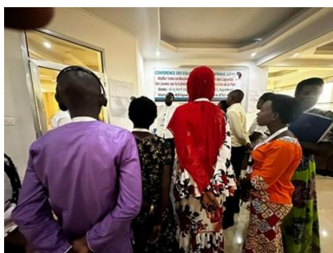
Group Discussions on conflict resolution