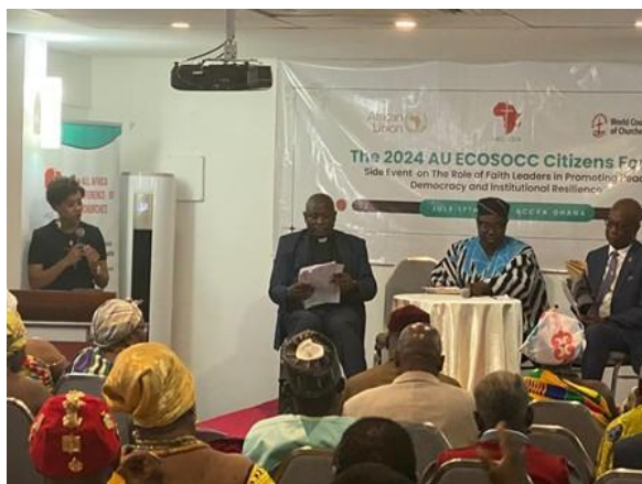
In session: AACC, WCC & AU CIDO Side Event on the Role of Faith leaders in Promoting Peace, Democracy & Institutional Resilience at the 2024 ECOSOCC Citizens Forum in Accra, Ghana

based organizations in supporting peace processes and democratic governance; Identified challenges and opportunities for collaboration between faith leaders, civil society, and policymakers in strengthening democratic institutions.