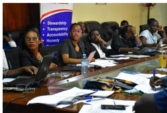
Participants in the IRCU Boardroom for the intergeneration consultation on 17 th December 2025.