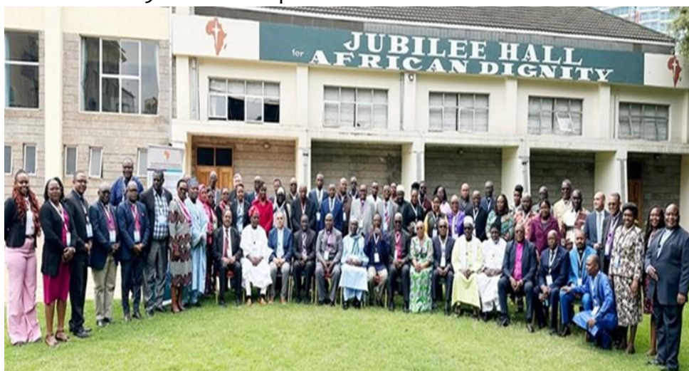
Continental AFAN-CJ Round Table

Between 27 th and 29 th August, AACC organized a continental review meeting on faith advocacy and activism for climate justice in Nairobi, Kenya. The meeting was attended by 82 (26 women and 15 youths) delegates including AFAN-CJ members and other key stakeholders (Government representatives, Civil society, Schools, and Multi-lateral institutions), country-level initiatives and 2025 plans were reviewed and key messages for AMCEN and COP29 were developed.