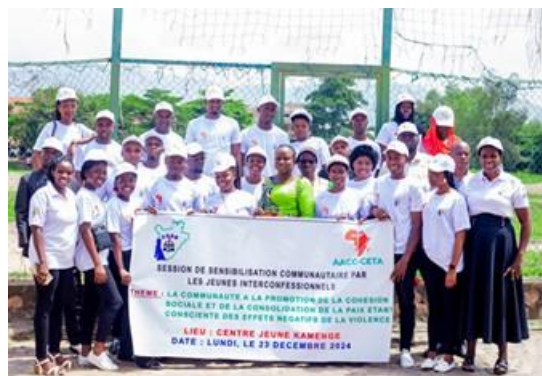
Friendly Football match during the community dialogue in Bujumbura

On the other hand, the youth Interfaith Network of Uganda held an intergenerational consultation with the conveners of the National Peace Pledge of the Inter-Religious Council of Uganda (IRCU), International Republican Institute (IRI), and the National Consultative Forum for political Parties and poltical organizations in Uganda (NCF)—at the IRCU Secretariat on the role of the National peace pledge in advancing the implementations of the UNSCR 2250 in Uganda. This took place on 17 th and 20 th December 2025. Much as the consultation met in person on 17 th December, the session on 20 th December was held via zoom. This meeting held on 17 th December 2024 also served as an opportunity to formalize YINU’s leadership role in monitoring adherence to the National Peace Pledge signed on October 25, 2024, as Uganda prepares for the 2026 General Elections. Signed on 25 October 2024, the National Peace Pledge is a commitment by Uganda’s political, religious, and civil society leaders to ensure peaceful elections. YINU monitors adherence to the pledge and leverages its structure and partnerships to promote social cohesion and prevent violence.