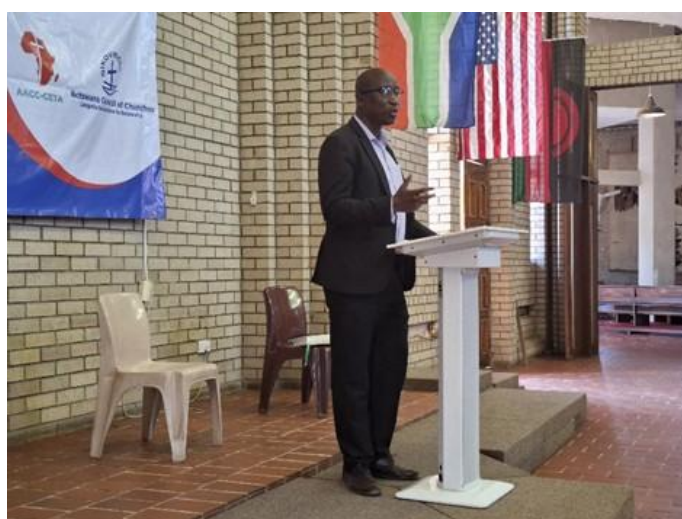
Botswana Council of Churches General secretary opening the celebration