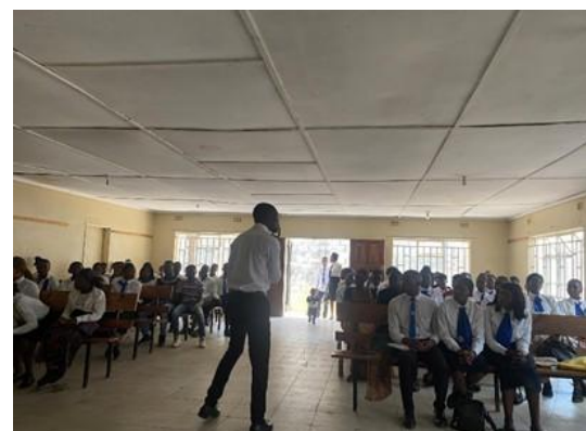
Youth leaders facilitating the