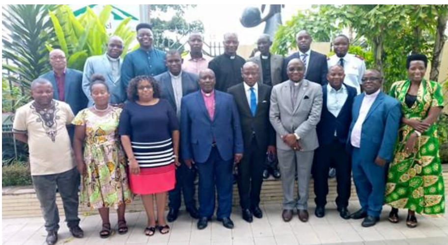
Church leaders at the consultation, City Hill Hotel, Bujumbura, March 26, 2024

On March 26, the AACC team had fruitful engagements with 16 church leaders from the AACC and Burundi Council member churches to enhance their commitment to building peace in the region in general and Burundi in particular. A presentation on the socio-political landscape in the region was made to help participants understand their own context. The church leaders had ample time to exchange on the issues in the region and came up with key issues needing attention.