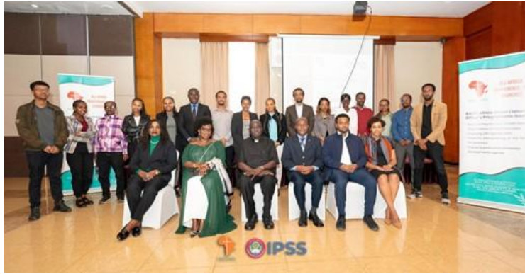
Group photo: Policy Dialogue participants