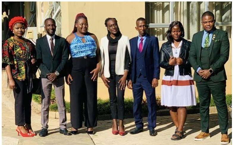
AACC delegates at the 2024 SADC People's Summit

AACC participated in the 44th SADC People's Summit in Harare, through seven youth leaders from churches in Southern Africa, and co-organizing two side events on economic justice particularly on Natural resource governance for equity and sustainable development in partnership with Zimbabwe Council of Churches and other partners. This summit was held under the theme; “Reclaiming SADC for people's development; Building people power, Voice and Agency towards Democracy and inclusion”. During the summit, the AACC delegates Youth leaders to engaged in constructive dialogues with other faith actors and Civil Society leaders on advancing advocacy for just tax systems and structures within the SADC region. They stressed the significance of the UN tax convention, urging CSOs and FBOs to create awareness on the impact of unjust taxation systems and enlighten people in their constituencies about the need and importance of the UN tax convention. In their various submissions, the young people successfully linked economic justice and natural resource governance to the values of Pan-Africanism and Ubuntu. They highlighted the prevalence of lucrative tax incentives that fuel tax inequalities, ultimately leading to detrimental ripple effects on service provisions and contributing to a cycle of poverty that persists across generations, severely impacting the majority of our citizens.