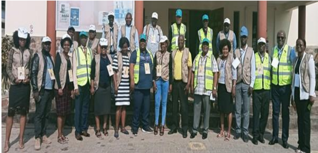
Group photo of AACC Peace mission and election observation in Mozambique