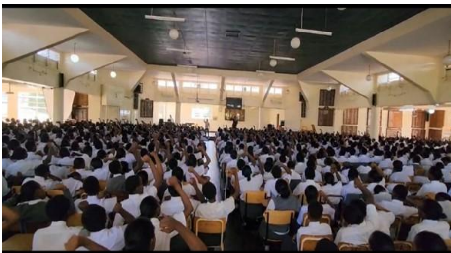
Teenage Students undertaking the pledge of Commitment to end SGBV during a school outreach organized on the international Women's Day in Kenya

Activism. Through activities, the AAYN Pledge of commitment to mobilize thousands of youth to commit to work for a GBV free Africa.