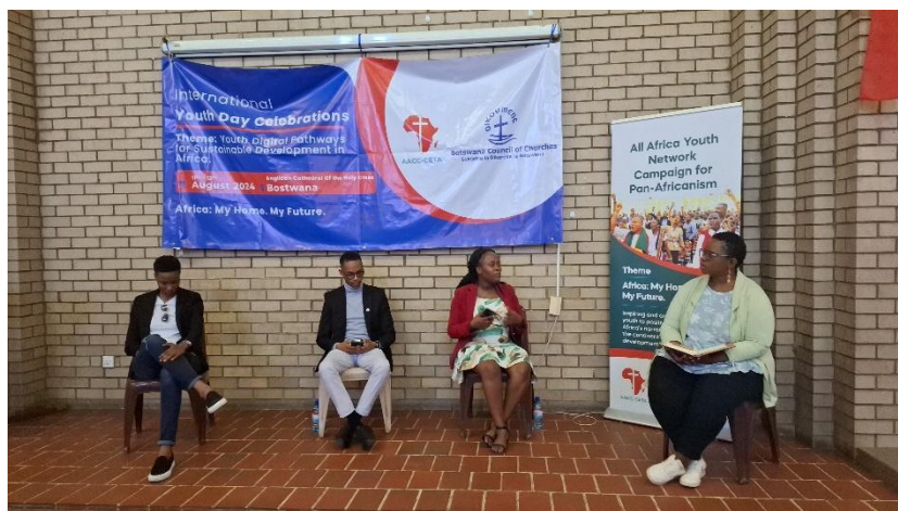
Group leaders sharing feedback from their group discussions