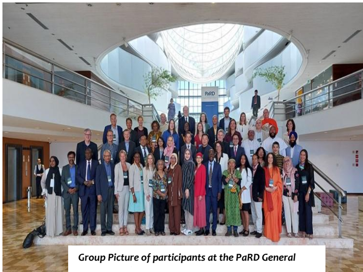
Group Picture of participants at the PaRD General

Additionally, AACC was represented at the 2024 PaRD Annual Forum, themed "Leave