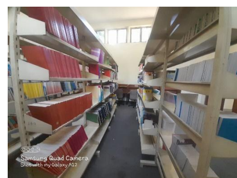
Section of the AACC Library

An archivist/ Programme Assistant was recruited from 6 th May and the major task was to Develop, organize, maintenance and day-to-day running of the Archives and the library. So far Nine (9) boxes of archive materials have been Digitized Identification, Classification and Indexing with the use of Keywords. Recording into Excel Document for easy access. Transfer of relevant books from Stores, dusting and arranging. Classification using Dewey Decimal Classification. Display of the Artifacts donated to AACC from different parts of Africa. Display of Framed Pictures on the library wall, as well as Books Displayer table.