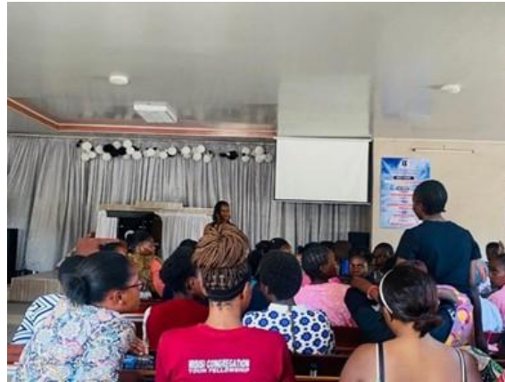
(Some of the participants during the dialogue at the Misisi compound RCZ on 15 th September 2024)

rights among youth in Zambian communities. The three-youth worked together to organize a series of peer-to-peers dialogues on SRHR in their local churches. The first dialogue took place on 15 th September 2024 at the Misisi compound RCZ. They used contextual bible studies to help participants understand the role of SRHR and sustainable families in promoting holistic health and healing, advocate for health seeking habits, and encourage them to transform cultural and religious values, attitudes and norms that endanger human dignity and quality of life.