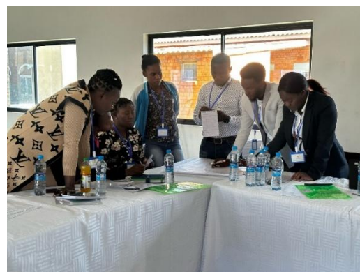
Some of the participants attending to group assignments during the training

effectiveness of the various responses to SRHR and Population growth issues in the bible and in contemporary society. Additionally, the process enabled participants understand how religion plays out as a major social determinant of the quality of sexual and reproductive health among individuals and communities, the extent of protection of sexual and Reproductive health rights, and population growth.