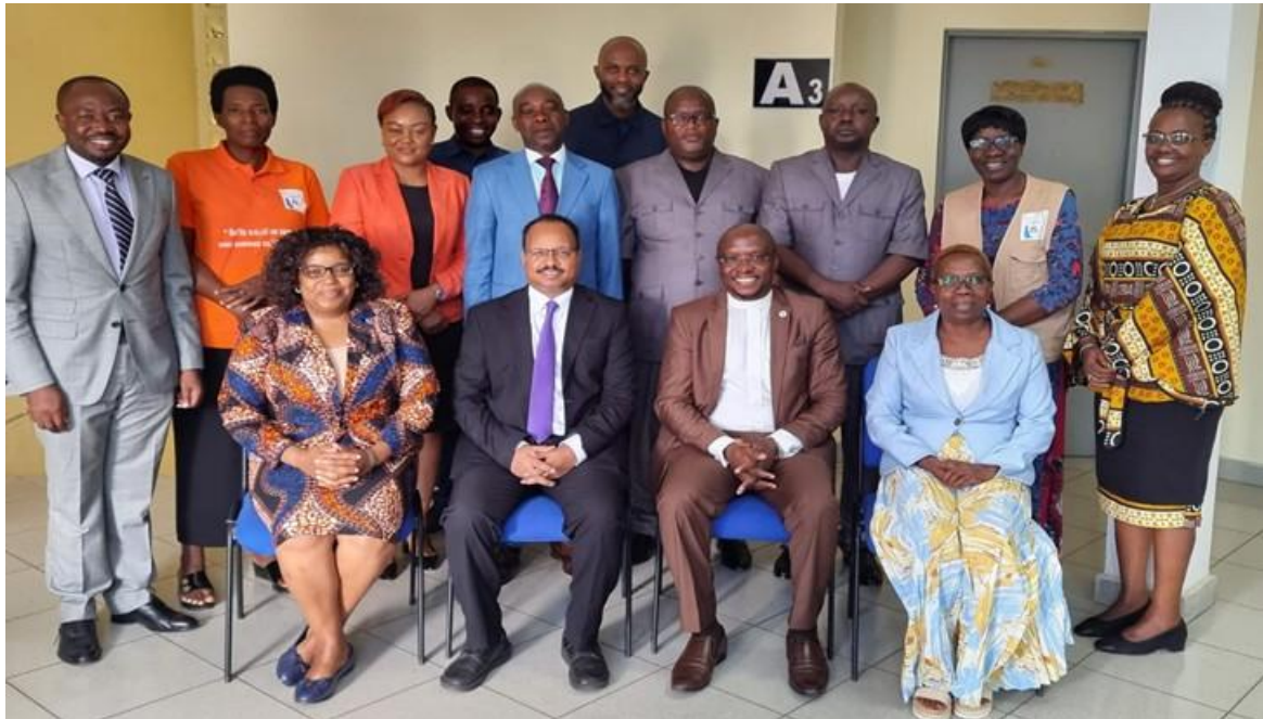
Photo of the team, at ICGLR offices in Bujumbura-Burundi, March 27, 2024

operationalization of the signed MOU. Thereafter, a joint task force was constituted to develop a operational plan for 2024/25.