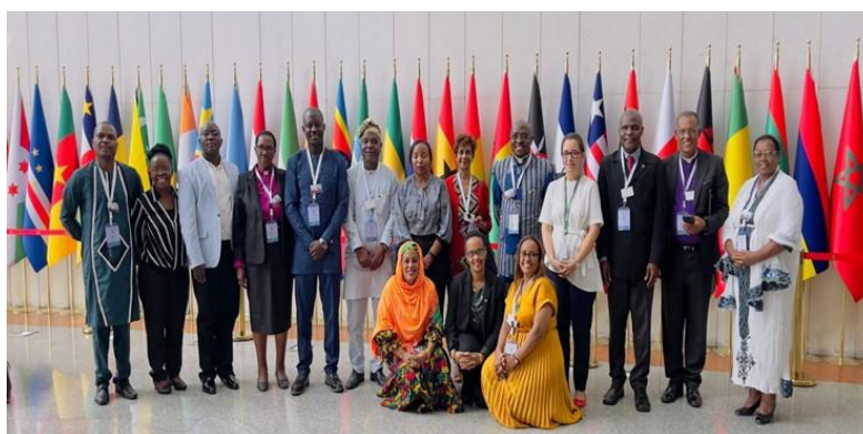
AFAN-CJ Members After the Meeting with the African Union Commission in Addis Ababa

The AFAN-CJ held productive engagement meetings in Addis Ababa, Ethiopia from 20 to 21 March 2024. The AFAN-CJ met with the African Union Commission (AUC) and the Ethiopian Minister of Environment, given Ethiopia's current chairmanship of the African Ministerial Conference on the Environment (AMCEN). The delegation also engaged the Civil Society Forum in Ethiopia. Proposals were made for strategic collaboration between the AFAN-CJ and the AUC within the existing AACC-AUC cooperation framework. Additionally, a similar framework between the Ethiopian Ministry of Environment and the AFAN-CJ (Ethiopia Chapter) was suggested.