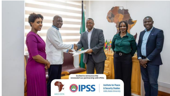
Occasion of celebrating the MoU signed between the AACC and IPSS

On 16 May 2024, the IPSS and AACC completed the signing of a renewed MoU. Areas of cooperation include: Joint evidence-based research, peace & security, governance, human rights, justice and dignity; briefing the African Union, its bodies and organs and their stakeholders