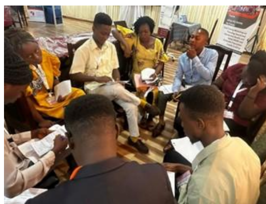
Some of the participants during group discussions and presentations