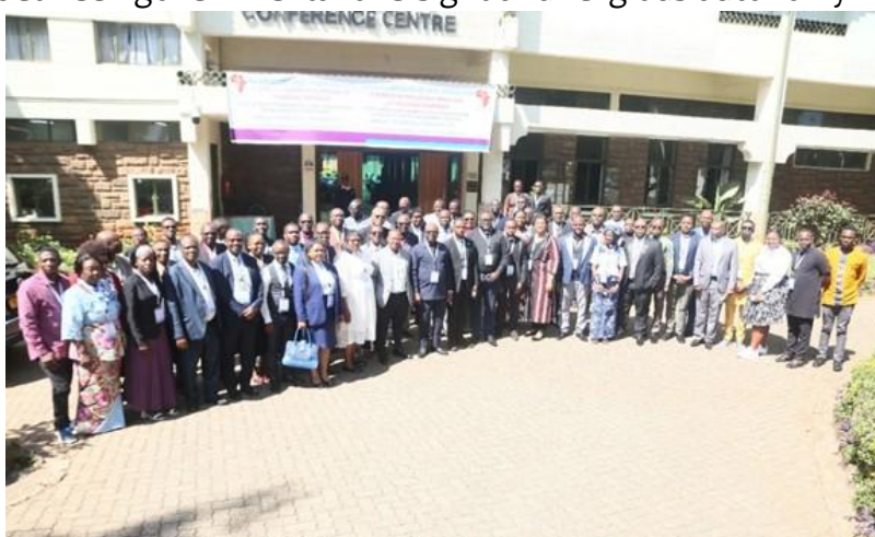
The 5th Annual Theological Symposium Group Photo 2024

In 2024, the AACC held its 5 th Annual Theological symposium on the theme: Role of Governments' Regulation on Churches and Religious Institutions in Africa . This was successfully held on October 28 th – November 1 st 2024, at Desmond Tutu Conference Center (DTCC) Nairobi, Kenya. It brought together 60 participants, including theologians, church leaders, policymakers, and representatives from across Africa. It sought to explore the balance between governmental oversight and religious autonomy. The symposium aimed to evaluate